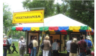
Arts and exhibits greet the thousands of attendees at the Festival of India.

The annual Festival of India is organized by ISKCON Toronto (also known as the Hare Krishna Centre). For over 40 years, ISKCON Toronto has been the hub of a rich, vibrant and enthusiastic community. The organization has helped share the ancient teachings of ancient spiritual India and has been a resource for tens of thousands of people who have sought to learn more about self-realization, self-development, mantra meditation, yoga, karma, vegetarianism and more. Aside from the organization of the annual Festival of India, ISKCON Toronto also regularly conducts programs for youth empowerment, community care and a “Food for Life” program involving regular outreach to the underprivileged via the distribution of hot vegetarian meals. Internationally speaking, ISKCON is a worldwide confederation of more than 400 centres, including 60 farm communities, 50 schools and 90 restaurants.