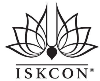
ISKCON is comprised of more than 400 centres, 60 rural communities, 50 schools and 90 restaurants worldwide.