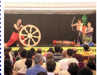
The Krishna Culture Festival Tour presents drama, dance and more!

Aside from the dances, dramas and musical performances which captivate audiences of all ages, the Festival of India features a Kids Zone which includes jumping castles, face painting, magic shows and more! With a focus on “family fun”, the Festival of India presents a unique educational opportunity for children of all ages.