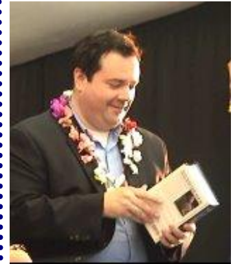
The Honourable Jason Kenney, during a recent Festival of India.