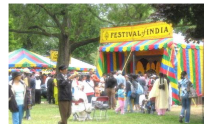
The Festival of India annually draws over 40,000 people over two days.