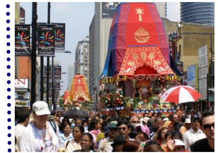
• A colourful parade down Yonge Street kicks • off the festival!