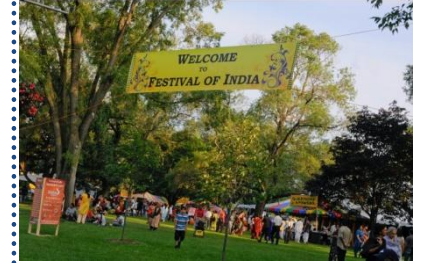
Arts and exhibits greet the thousands of attendees at the Festival of India.

The Festival of India is featuring a pre-festival at Yonge-Dundas Square, to give the City of Toronto a preview of things to come. This year's pre-festival will take place on Sunday, June 26th, 2016 . Please contact us for additional details about vendor opportunities at this event (deadline June 1 st ).