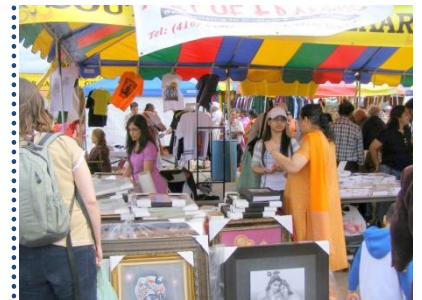
A busy vendor receiving the public.