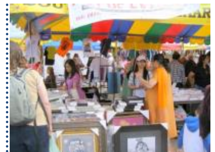
A busy vendor receiving the public.