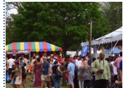
The vendor area is always a hub of activity!