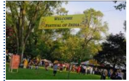
Arts and exhibits greet the thousands of attendees at the Festival of India.

Vendors can certainly benefit from the high levels of exposure for their products and/or services at this vibrant and colourful outdoor event. Our Bazaar is one of the key attractions of the festival and is growing every year!